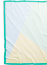
MINI - MINT

The colourful pattern of the Summer Stripes series makes these Breezyblanket designs truly special. Mango, aqua, and mint – each exude a relaxed summer vibe that makes feeling comfortable even easier, whether at home, in the garden, park, or on the go.