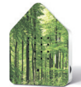
FOREST Body: White Front: Design