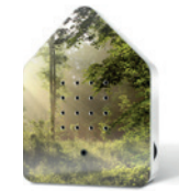
SUNBEAM Body: White Front: Design