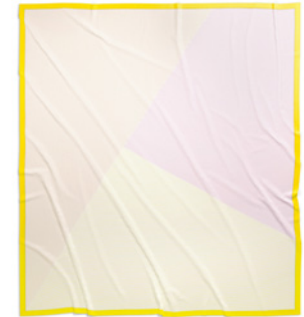
DOUBLE - MANGO