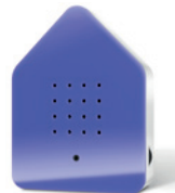
VIOLA Body: White Front: Classic