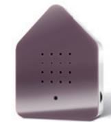
MAUVE Body: White Front: Classic