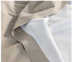
SINGLE REVERSE TAUPE