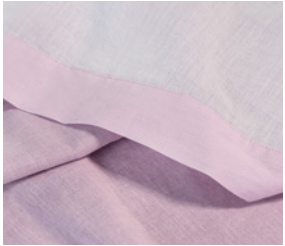
SINGLE REVERSE BERRY

Thanks to its elegant reversible design, the Breezyblanket Reverse can be easily transformed. Fruity berry, elegant taupe, or timeless grey make a great impression anywhere: on the terrace, the sofa, or wherever you love to feel comfortable.