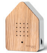
OAK Body: White Front: Wood