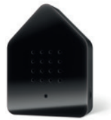
BLACK DARK Body: Black Front: Classic