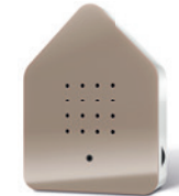
TAUPE Body: White Front: Classic