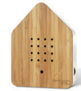
BAMBOO Body: White Front: Wood