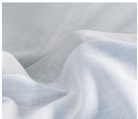
SINGLE REVERSE GREY