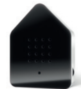
BLACK Body: White Front: Classic