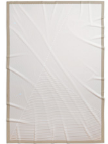
SINGLE - TAUPE