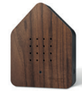
WALNUT DARK Body: Black Front: Wood