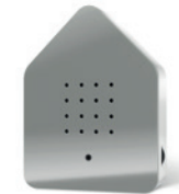
GREY Body: White Front: Classic