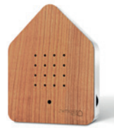
CHERRY Body: White Front: Wood