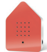
RED Body: White Front: Classic