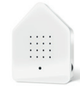
WHITE Body: White Front: Classic