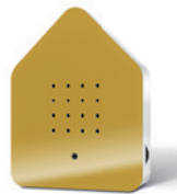
YELLOW Body: White Front: Classic