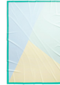
SINGLE - MINT