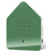
GREEN Body: White Front: Classic